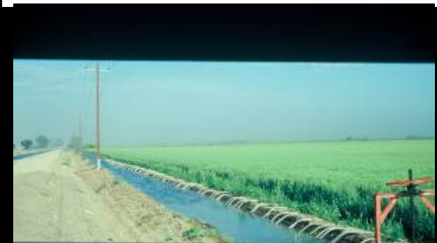
Rio Yaqui irrigation canal