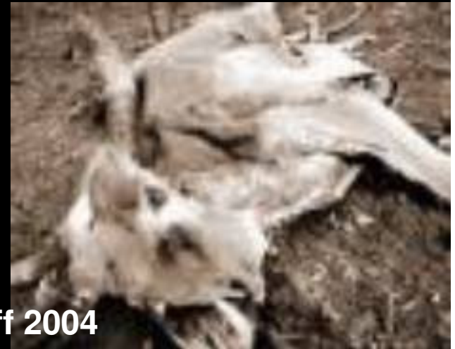
Sonora cattle die-off 2004