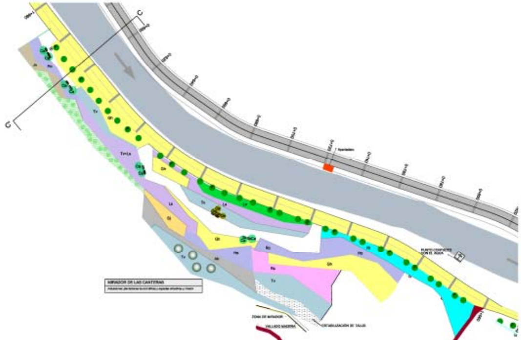
TRAMO 5 : ZONA AJARDINADA "LA CANTERA"